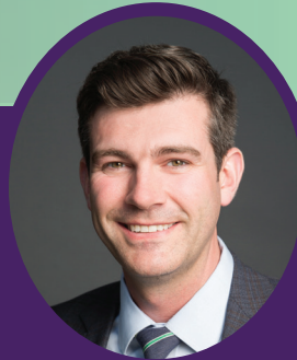
Mayor Don Iveson Guest of Honour